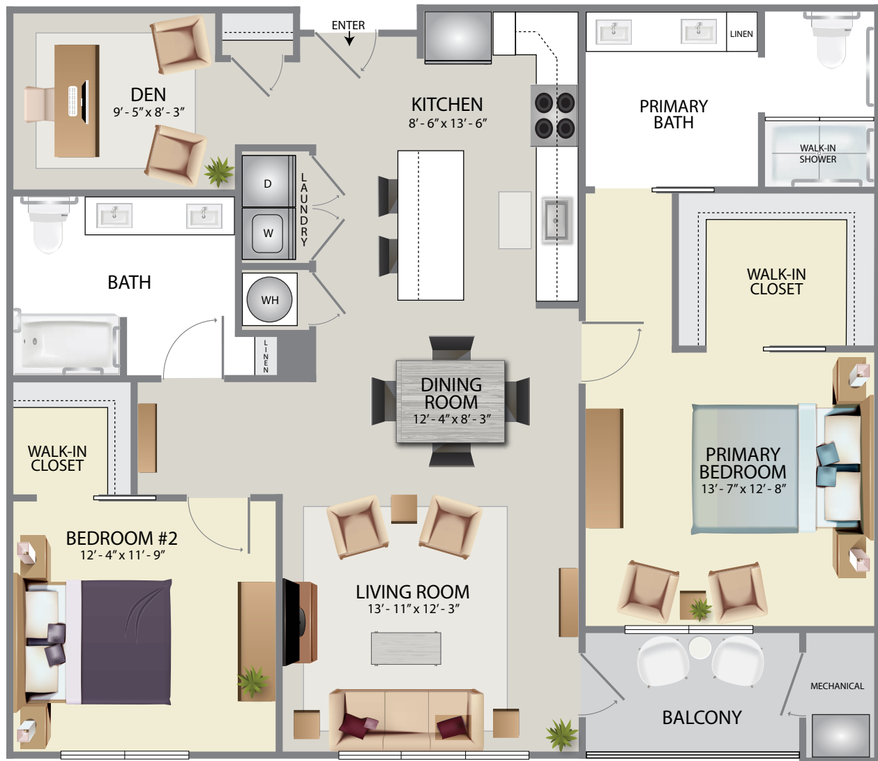
2ND - 5TH FLOOR