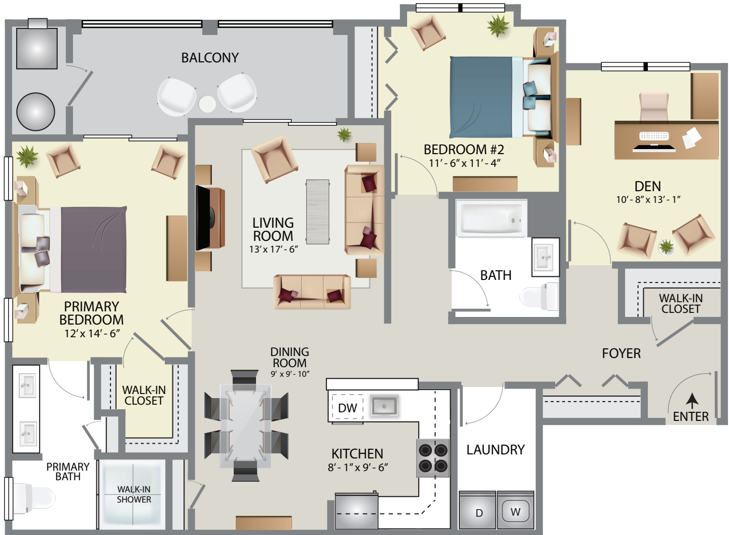
2ND - 4TH FLOOR