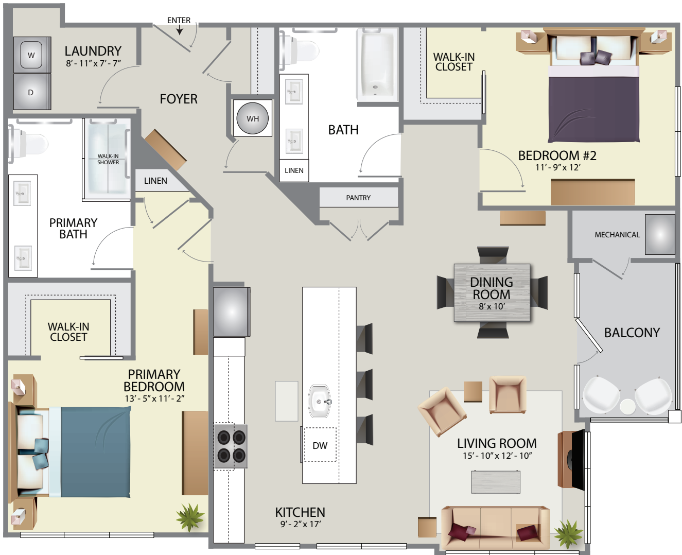
2ND - 5TH FLOOR