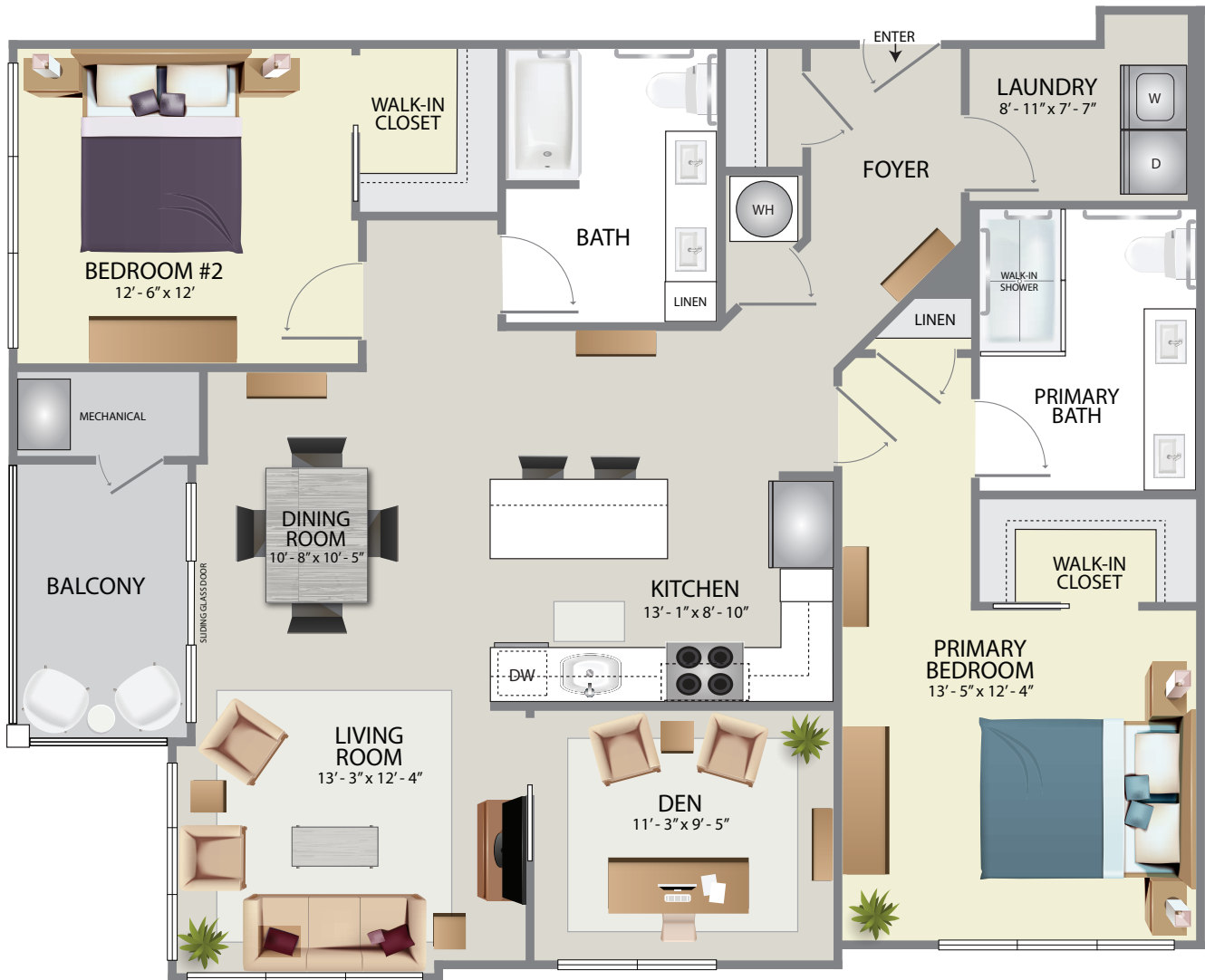
2ND - 5TH FLOOR